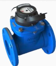
Woltman Water Meter