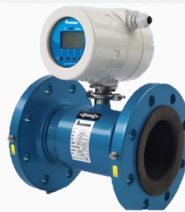
Electromagnetic Flow Meter AC/DC Powered