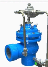
Quick Pressure Relief Valve