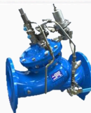
Surge Anticipating Valve