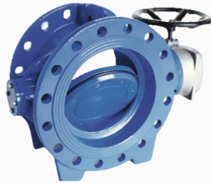
Butterfly Valves (Wafer, Lug, Concentric, Double Eccentric)