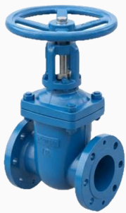
Gate Valves (Metal & Resilient Seated)