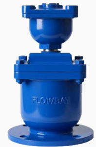
Air Valves (Double, Triple, Air Cushion)