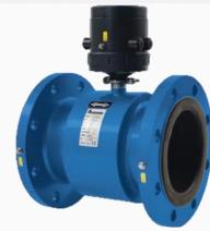
Electromagnetic Flow Meter Battery Powered