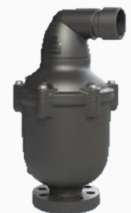
Air Valve (SP Disc)