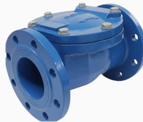
NRV Check Valves (Swing, DPCV, MPCV, Zero Velocity)